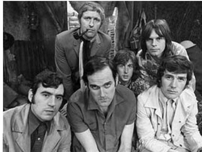
The group in 1969